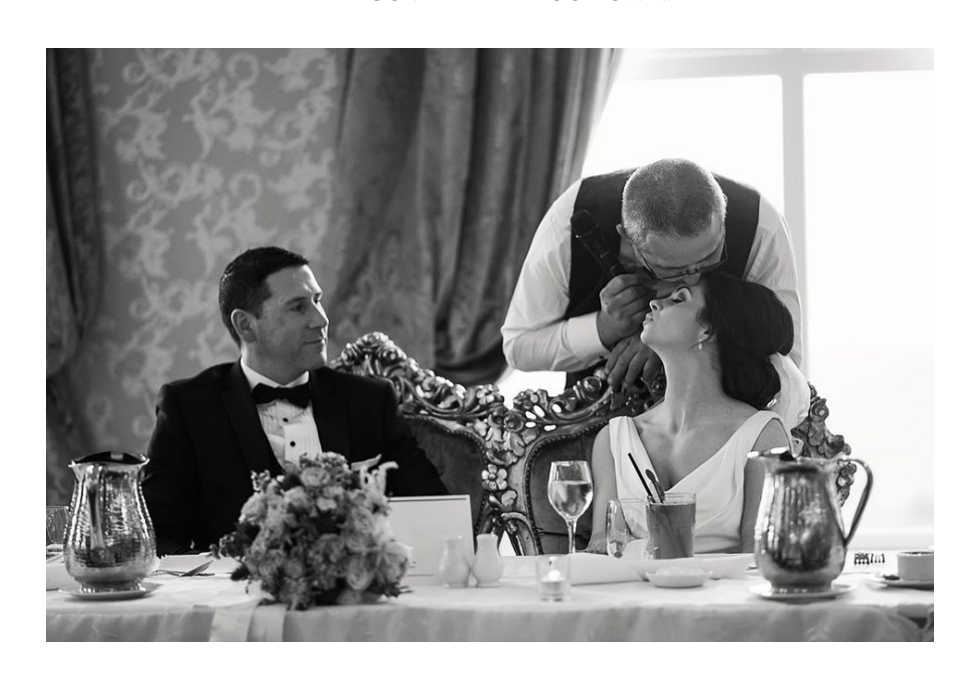
CA Million Times Over, I will always Choose You

In order to give you complete peace of mind on your special day, we have designed 3 different packages which gives you the flexibility to make your day completely your own.