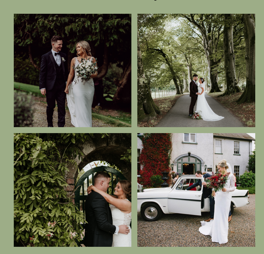
Such moments are brought to you by....