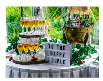
Something for Everyone £5.95 per person